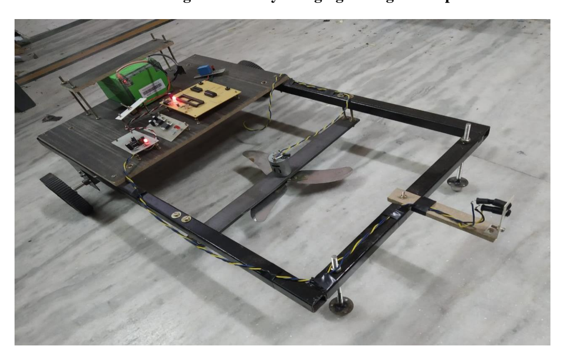
Fig.6.2 movement of machine through battery