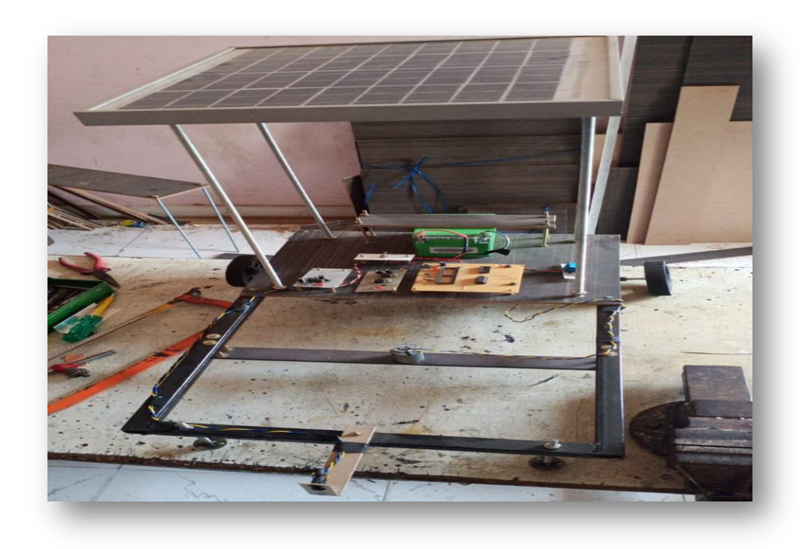
Fig.6.10 Battery charging through solar panel